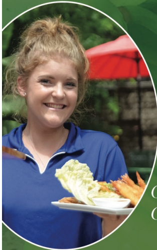
Garden Cafe and Kiosk

Australia's premier water garden with over 14 acres to explore