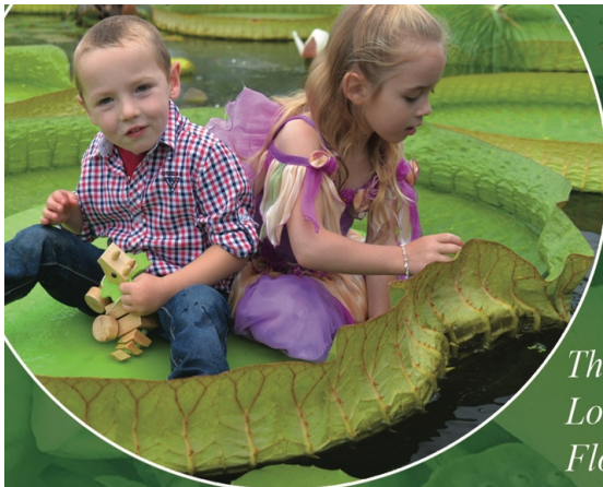
Thousands of Lotus and Waterlily Flowers