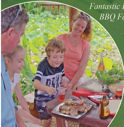
Fantastic Picnic and BBQ Facilities